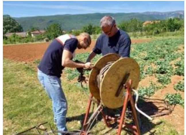
Local volunteers learn to work with drip irrigation

Even with irrigation, the heat and drought caused stress. They were able to keep the plants growing, but production was greatly reduced.